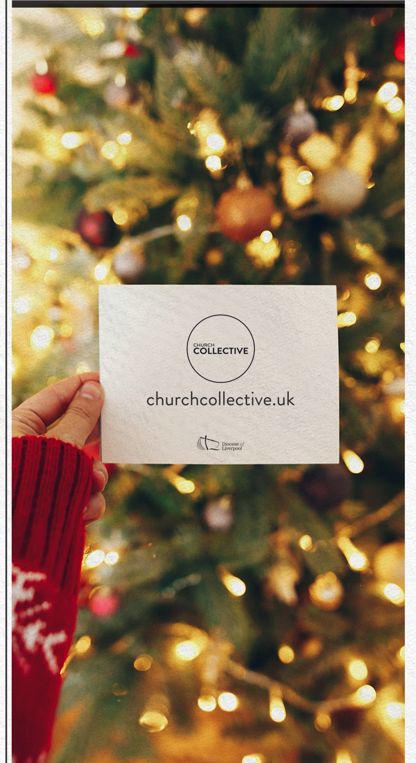
CHRISTMAS LIGHTS: A PRAYER WALK GUIDE